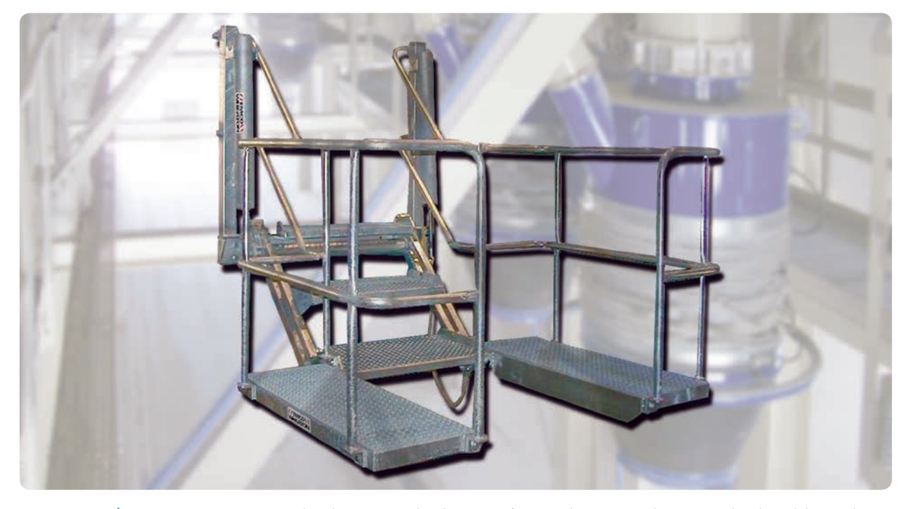
LISTENOW LKS 07/2019 EN • We are committed to the constant development of our products, texts, diagrams and technical data and reserver the right to make changes to this information at any time.